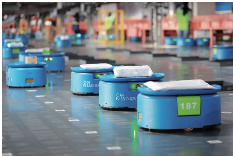
Fig.2 Application of 5G in Logistics

5G communication technology makes the operation of the intelligent logistics warehousing information system more efficient and stable, making the use of drones, robots, unmanned shuttles, AR glasses, and automatic sorting equipment in the carrier execution level more reliable, and at the same time can realize the execution level the decentralization of data transmission, when the system is running, the data source at the end of the execution layer is directly uploaded to the data cloud for processing, and then the system instructions and operation instructions are issued downwards to promote the logistics warehousing process from the arrival, inspection, picking, inventory, and packaging of goods And delivery and other operations to achieve a comprehensive data warehousing environment, visualization and automation, as shown in Figure 2. The use of robots, unmanned shuttles, and automatic sorting equipment has streamlined manual operations, greatly reduced labour costs, and to a certain extent, ensured the safety of warehouse operations, optimized item inquiries, and improved outbound and inbound storage efficiency, easy for systematic management of warehouse [5].